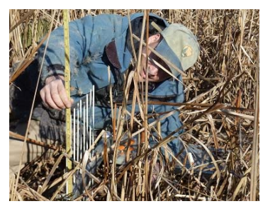
NPS monitoring program collects data on Dyke Marsh.

collect data (https://science.nature.nps.gov/ im/units/ncrn/ monitor/index.cfm). Over the ensuing years we have gathered and analyzed copious amounts of data, and made the findings and results available to park resource managers to assist with resource