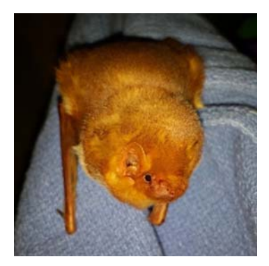
Eastern red bat is a local species that is frequently heard.

5. Two bat species that are not classified as Northern Virginia bats have nevertheless become