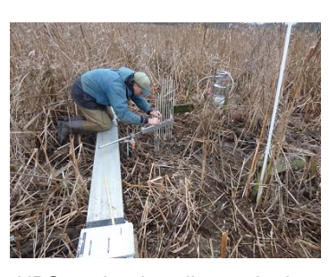
NPS worker installs monitoring equipment at Dyke Marsh.

Early efforts by the I&M program (2000-2005) focused on inventories to establish baseline knowledge about the status of park natural resources. Across the nation, the pro-