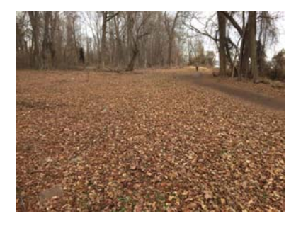
This bare land along Haul Road has been cleared of invasive plants.

In the spring, working with NPS, we will plant a mix of native plants there, species that co-evolved with native birds