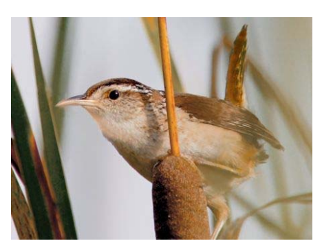
Marsh wrens have historically nested in Dyke Marsh.

It's easy to imagine new species forming in isolated places like remote islands, but what about right in your own backyard? The fact is, the basic processes of evolution are happening in every generation in every species, but they are typically slow and subtle. Dr. Luttrell's work aims to better understand how evolution works by studying subspecies of birds. Bird subspecies, distributions, and natural history have been well defined by hobbyists and professionals alike, making them an ideal group for understanding evolution. She will talk about how comparing multiple traits including plumage color, size and shape, vocal behavior, and genetics in marsh wrens has revealed an exciting pattern of evolution in this widely distributed coastal marsh bird.