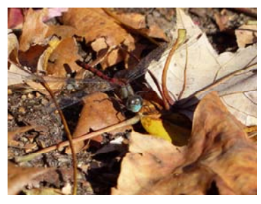
This blue-faced meadowhawk dragonfly represents a new record for Dyke Marsh and the GWMP.

The Odonata Central website says that this species "is partial to shaded areas and forest edges. . . perches at the tips of twigs, stems and grasses, but it often does so at greater heights than other species . . The female