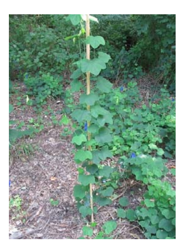
Yellow passionflower vine in the Dyke Marsh native plant restoration area, staked up by volunteers.

Yellow passionflower is a perennial herbaceous climbing or trailing vine that grows from 12 to 36 feet in length. It is native to the mid-Atlantic and southern U.S., from