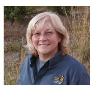
Cathy Ledec.

shorelines, at times with an errant, large blue barrel or tire in tow. Ned recently found a new native plant not previously identified among the more than 1,300 species already documented from a local national park. Ned is fluent in Spanish, prepared a FODM flyer in Spanish and encour-