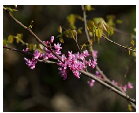
Eastern redbud (Cercis Canadensis)

Northern Spicebush (Lindera benzoin) ... blooming now.