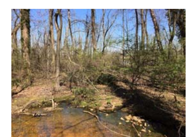
Wetlands like Dyke Marsh are like sponges and help control flooding.

commercial fish and shellfish most use wetlands tidal as spawning and nursery areas," noted Kathy Reshetiloff, U.S. Fish and Wildlife Service. "About one-third of the nation's threatened or endangered wildlife also depend on wetlands for habitat." Calling wetlands