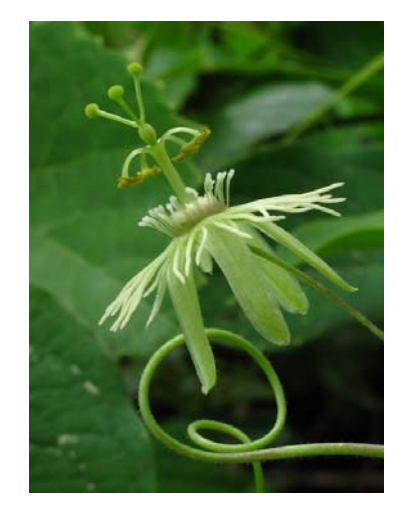
Close-up of yellow passionflower blossom.

The yellow passionflower vine has considerable value to wildlife. The flowers provide nectar for butterflies and other insects, the fruit is eaten by birds and small mammals, and the leaves are a major food source for the caterpillars of several neotropical butterfly species, including the Julia Heliconian (Dryas iulia), Mexican fritillary (Euptoieta hegesia), Gulf fritillary