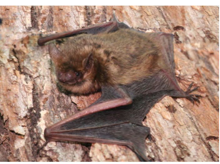
A tri-colored bat ( Perimyotis subflavus)

To learn more, visit Bat Conservation and Rescue of Virginia, at https://www.virginiabats.org/. This program is sponsored by FODM, the Friends of Huntley Meadows Park and the Friends of Accotink Creek.