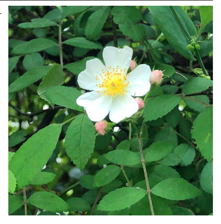
Swamp rose (Rosa palustris)

The leaves are pinnately compound (leaflets arranged along an axis like a feather) with the leaf axis softly pubescent (hairy), leaflets commonly seven, narrowly elliptic to oblanceolate, softly pubescent