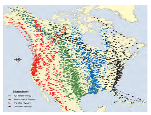
There are four major North American flyways. Map courtesy USFWS.

This estimate is provided by a fascinating website, https://birdcast.info/, which uses weather surveillance radar to report an estimated number of birds passing through a locality overnight and the expected species. Maps show predicted nocturnal migration three hours after local sunset to early morning and are updated every six hours. Most birds that migrate travel at night.