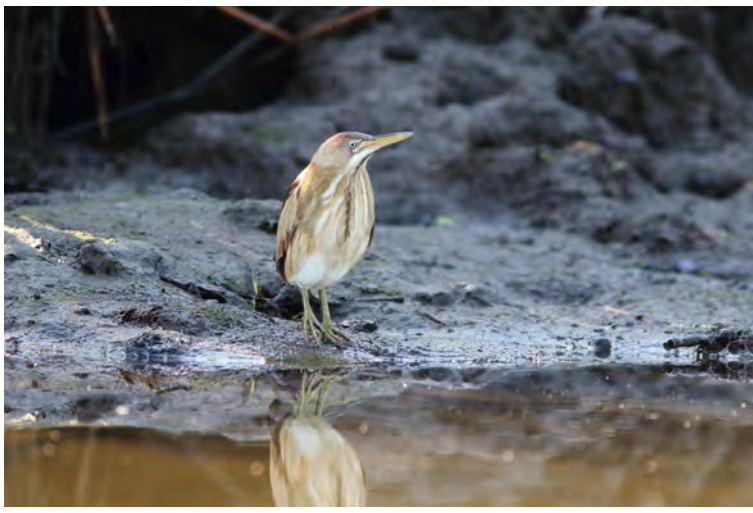
A female least bittern in a Dyke Marsh tributary

In recent years, our surveys have shown that least bitterns ( Ixobrychus exilis ) have retracted from the southern portion of the Big Gut and are concentrating their breeding activities to the