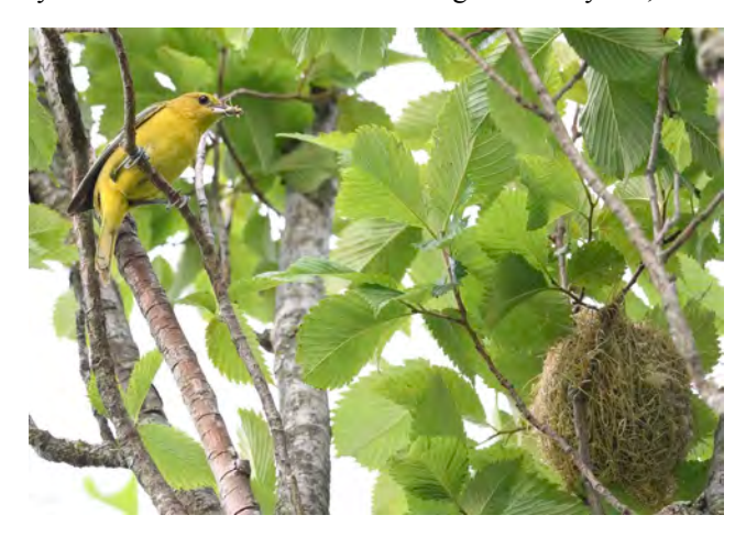
A female orchard oriole with food for nestlings

Besides blue-gray gnatcatchers, likely victims of predation 2021 were eastern kingbirds (Tyrannus tyrannus), warbling vireos (Vireo gilvus), red-eyed vireos (Vireo olivaceus), American robins (Turdus migratorius), cedar waxwings (Bombycilla cedrorum) (Many waxwings on the Haul Road abandoned their nests almost as soon as they completed construction.), orchard oriole (Icterus spurius). Baltimore oriole (Icterus galbula) yellow warblers (Setophaga petechia). Baltimore orioles and yellow warblers have been declining in recent years, so