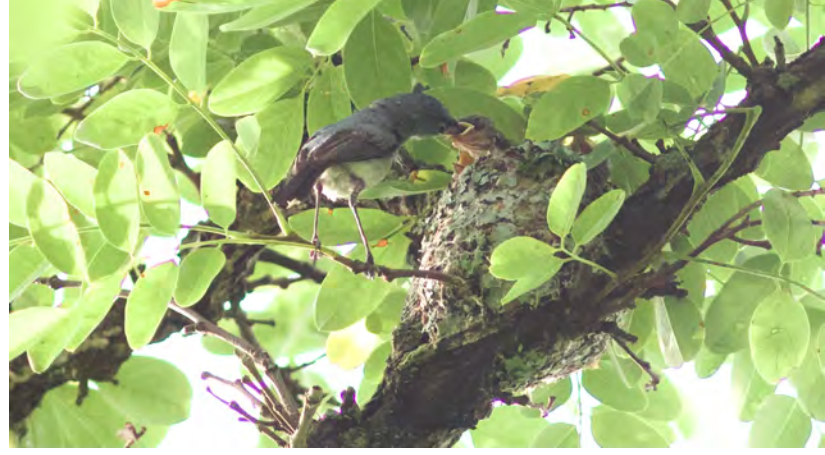
A blue-gray gnatcatcher feeding nestlings

Ground and cavity nesters seem to have done better overall than tree nesters in 2021. Volunteers discovered a brown thrasher ( Toxostoma rufum ) ground nest adjacent to the canal at West Dyke Marsh that fledged two