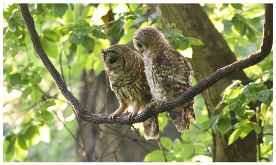
An adult barred owl with one of three fledged youngsters near the entrance to the Haul Road

leucocephalus) and ospreys (Pandion haliaetus) in Dyke Marsh. Bald eagles occupied all three nests as spring arrived. The primary "show" was at the Haul Road nest as photographers birders and alike gathered to watch the nest with the breeding pair showing obvious concerns. The bald no produced two healthy nestlings that fledged by the end of May. The Haul Road nest has been active since 2018 and the adults have successfully produced fledged young all four years. I have no information on the success of the Tulane Drive or Morningside Lane nests, except that no young were