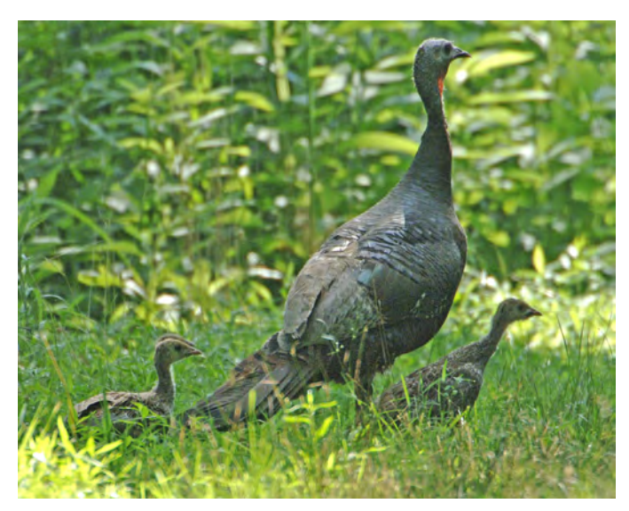
A turkey hen with three juvenile turkeys

Presently, we continue to see the results of this conservation success, with turkey populations slowly expanding north and eastward into the suburban and urban areas of the region. The Washington, D.C., area is not the only place that "city turkeys" have popped up in. Wild turkeys caught national attention in 2020-2021 with articles published in popular media outlets including The Guardian