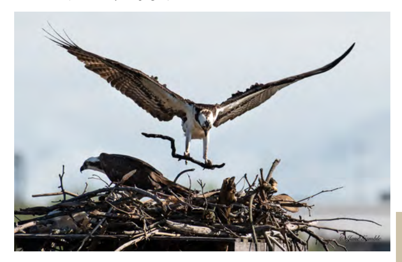
An osprey bringing a stick to the Belle Haven Marina platform nest