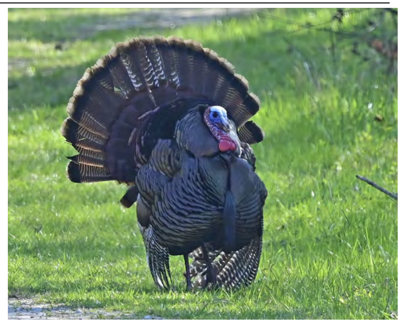
A tom turkey displaying