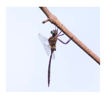
A regionally rare dragonfly, the fine-lined emerald, was seen in Dyke Marsh.

paths and over trees next to water. One was initially seen on August 14 and photographed again on September 4. It is likely that a small population breeds in Dyke Marsh. Dragonflies are fascinating insects that evolved from the order Protodonata about 325 million years ago. They are amazing aerialists and hunters.