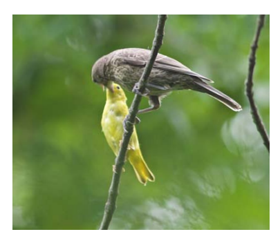
A female Yellow Warbler feeds a much larger Brown-headed Cowbird fledgling.

Warbler. Eastern Kingbirds sometime don't concern themselves with such incidentals as nest concealment. During a June 18 canoe survey into the Big Gut, I was surprised to find a completely exposed Eastern Kingbird nest with nestlings about 40 feet up in a dead Sycamore. Another