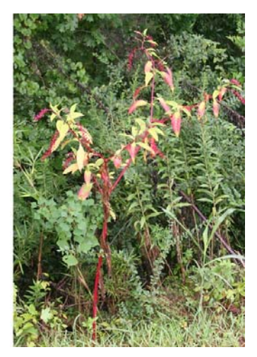
Whole plant with magenta stems.

Don't be tempted, though—all parts of the plant are toxic, especially if fresh and eaten in quantity. Pokeweed was sometimes used by Native Americans and European settlers as food and for medicinal purposes—and it is still eaten in parts of the southern U.S., where it