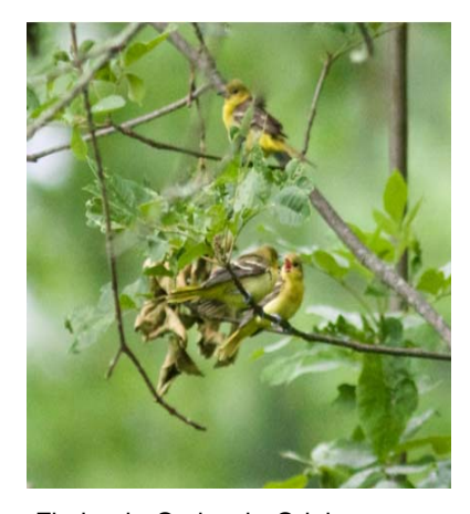
Fledged Orchard Oriole young with their mother perched on branch above.

significant loss of ducklings in a brood only a few days old seems highly unlikely. An egg predator would probably consume the whole clutch. Therefore, I tend to discount predation as a significant cause of small broods. We often see these small brood young several weeks after hatching and they appear quite healthy, so survival rates may be good in the first months of their lives. The data also shows that breeding bird survey observers often report the cavity nesting Wood Duck with smaller than normal broods at Dyke Marsh. There may be explanations here that I have not yet entertained. Research continues.