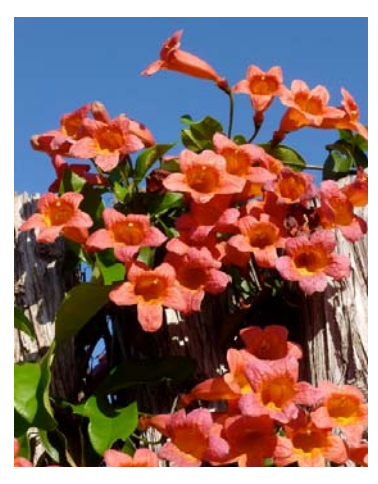
Crossvine is a hummingbirdpollinated flower.

tracting pollinators through flower shape, color, fragrance, and other characteristics. For example, beepollinated flowers are often white, yellow. or blue and have a pleasant fragrance and sticky, scented pollen. Butterfly-pollinated flowers tend to be bright colored, often red or purple, with only a faint odor, producing limited pollen but ample nectar. Bird-pollinated plants tend to be red or or-