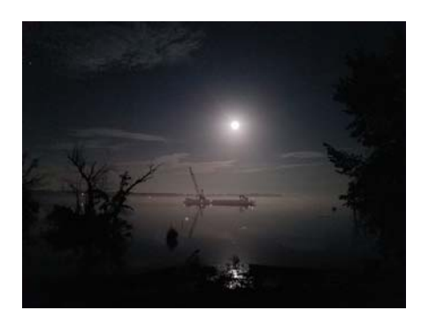
The full moon over Dyke Marsh illuminates a barge and crane, part of restoration activity.

Just off Dyke Marsh, the machinery of restoration is very visible and working daily in the Potomac River. With big barges, cranes and boats, crews are building the breakwater, the first stage of restoration. U.S. Geological Survey and National Park Service (NPS) experts identified a breakwater as the first priority of restoration, a riprap structure designed to replicate the historic promontory removed by dredgers. Removing the promontory altered the hydrology of the marsh. The breakwater would "redirect erosive flows in the marsh, particularly during strong storms and would reestablish hydrologic conditions that