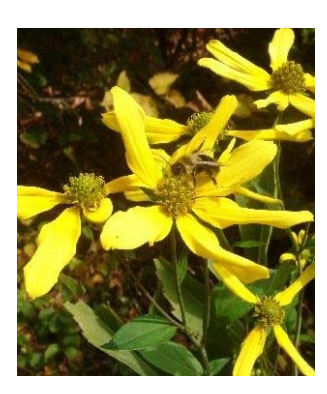
Wingstem is a generalist, attracting many different pollinators.

published in the journal Ecology, biologists from Worcester Polytechnic Institute (full disclosure: WPI is my alma mater) studied the response of bumblebees to two related plants, scarlet monkeyflower (Mimulus cardinalis), which is primarily hummingbird pollinated, and purple monkeyflower (Mimulus lewisii) which is bee pollinated. Their results showed that M. cardinalis flowers "impose