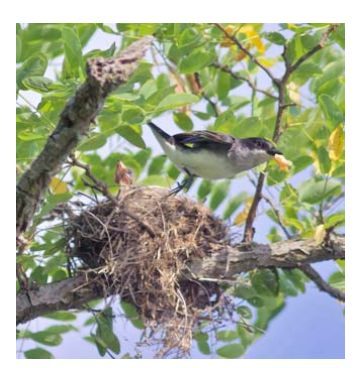
An Eastern Kingbird removes a fecal sac from a nest in a Black Locust.

A pair of Bald Eagles was first reported perched beside the Osprey nest on Dyke Island on April 7, effectively blocking repeated attempts by the Osprey breeding pair to access the nest. The Bald Eagles soon became interested in the Osprey nest on the adjacent Coconut Island and perched beside this nest as well. With the larger and more dominant eagles controlling the situation on the islands, both Osprey pairs eventually abandoned their breeding efforts. The Bald Eagles never made any attempts to destroy or use either the Dyke or Coconut Island nests but seemed content in just preventing the Ospreys from using them.