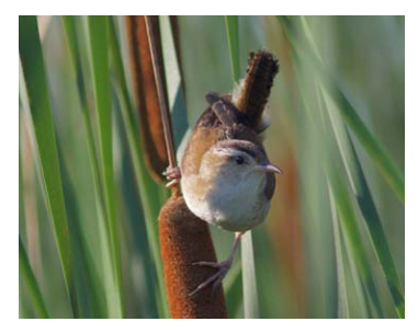
A territorial Marsh Wren in the south marsh.

north of Haul Road. Marsh Wrens disappeared from the Big Gut in the south marsh after 2006, but a few birds returned to occupy a tributary of the Big Gut that we unofficially call the Northeast Passage between 2011 and 2013. They failed to return to the south marsh in 2014.