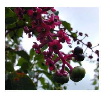
Close-up of berries.

When you think of fall colors, magenta may not be the first to spring to mind. But when the stems of the pokeweed plant ( Phytolacca america-na ) turn from green to magenta, it's as much a sign of fall as any red or orange leaf.