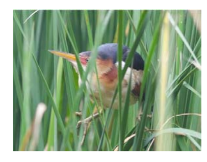
A Least Bittern peers from the marsh vegetation on Dyke Island.

active nest as potentially leading to a return of a viable Marsh Wren breeding population. The decline in the fortunes of this species at Dyke Marsh has been an ongoing process for over two decades. It may be part of a regional decline. Hopefully the marsh restoration will lead to some stability in the marsh habitat and in the absence of other unforeseen negative influences, the Marsh Wren may establish a presence that we can once again enjoy.