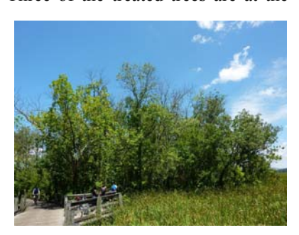
These treated pumpkin ash trees still have healthy leaf growth.

edge of the grove facing south towards the boardwalk including the one closest to the boardwalk. Interestingly, a small tree next to it that was not selected due to earlier beaver damage still has full leafing. If our selected trees re-