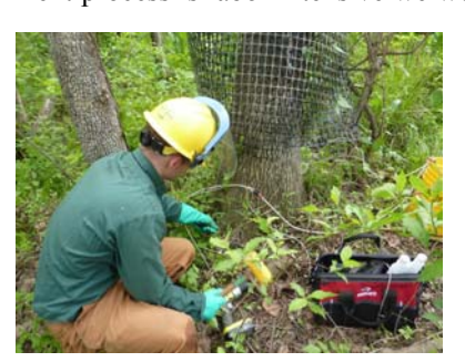
Insecticide is injected into the root flares of the pumpkin ash tree.

Because the insecticide is very expensive and the treatment process is labor intensive we were only able to treat a