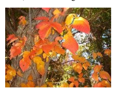
The three-leaved poison ivy fall foliage is orange to red.

Poison ivy is a deciduous perennial that is extremely variable in form; it can occur as a ground cover, an erect shrub, or a climbing vine. The vines can become quite