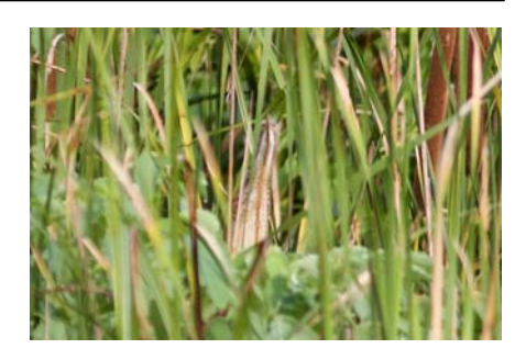
The Least Bittern freezes in place and extends its neck to camouflage with the marsh reeds.

The Least Bittern usually climbs through dense vegetation in a deliberate pattern, grabbing cattails or other stalks with its long curved claws, but it can also hop and move, ro-