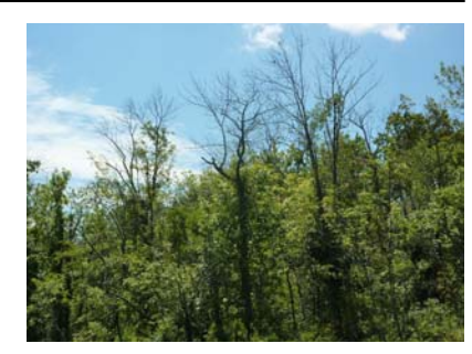
Significant leaf loss is observed among the pumpkin ash trees.

As of early August significant leaf loss can be observed among the ash trees along the boardwalk (see