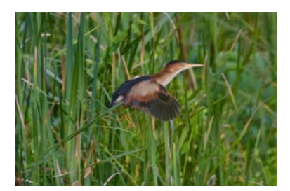
A juvenile Least Bittern emerges from cover.

weigh about 10 to 20 grams. By the 15th day they weigh 50 to 70 grams (almost as much as an adult.) Least Bittern voung can leave the nest by the fifth day after hatching and can grasp vegetation with their long claws. Parents pro-