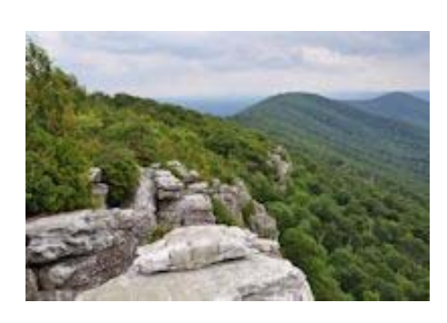
Scenic view of the George Washington National Forest.