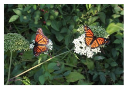
These viceroy butterflies nectar on the poison water hemlock's white floral clusters.

We have completed major "housekeeping," including updating our bylaws