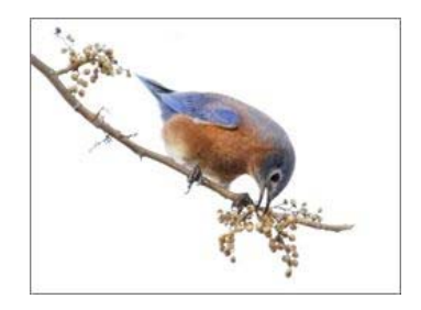
Many birds, including this bluebird, eat the berries of poison ivy.

Poison ivy provides food for a number of animals. White-tailed deer, muskrat, and eastern cottontail rabbits eat the leaves and stems and more