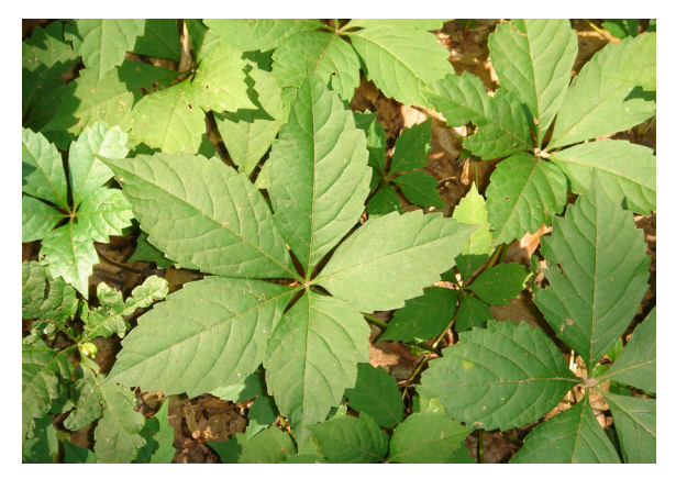
Virginia Creeper ( Parthenocissus quinquefolia ) - five oval-toothed leaflets; turn orange-red in autumn; climbs. Flowers are small, greenish; fruits are dark blue at branch tips