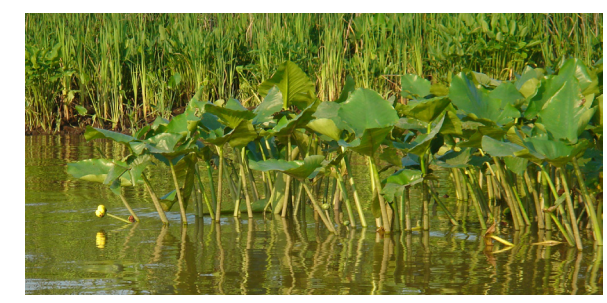
Spatterdock or Yellow Pond Lily ( Nuphar advena )-aquatic water lily with floating leaves and yellow, 1-2-inch "golf ball" flowers