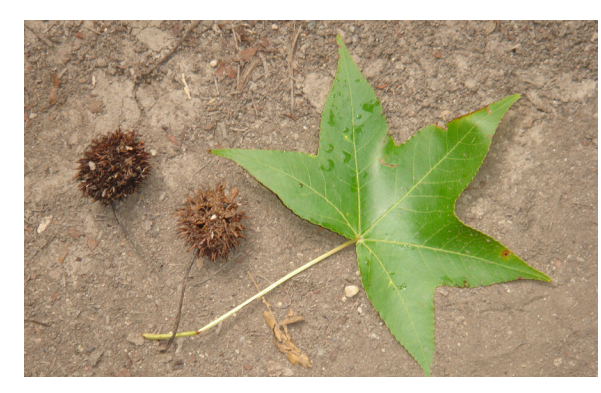
Sweet Gum ( Liquidambar styraciflua ) - up to 120 feet tall, star-shaped, toothed leaves; fruits are brown, burr-like; gray to brown furrowed bark