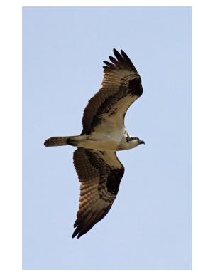
Osprey (Pandion haliaetus) - brown and white 24-inch raptor, brown stripe through the eye; swoop and perch along shorelines, hover over water and plunge feet first for fish