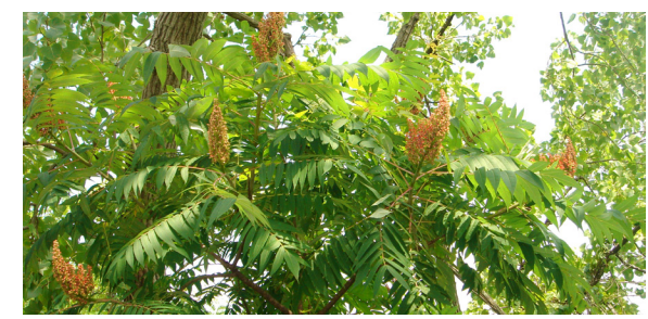
Smooth Sumac ( Rhus glabra ) - up to 20 feet tall; deciduous; branches have velvety hairs; erect yellow-green flowers in summer, dark red fruit in fall