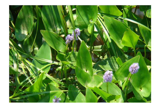
Pickerelweed ( Pontederia cordata ) - triangular green leaves and spikes of violet flowers