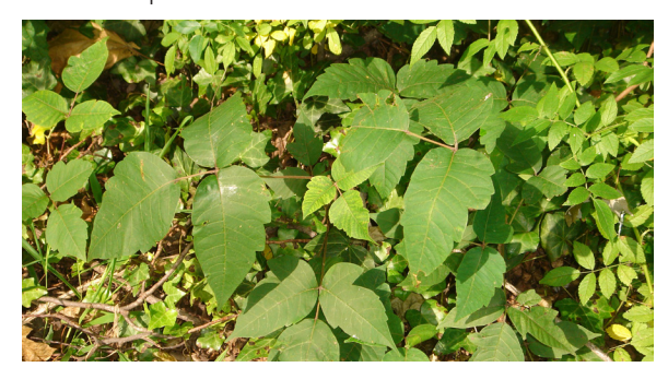
Poison Ivy ( Toxicodendron radicans ) - shiny green leaves in groups of 3 that climb and turn red in autumn; leaf is oval, pointed and slightly toothed. All parts are toxic to humans all year.