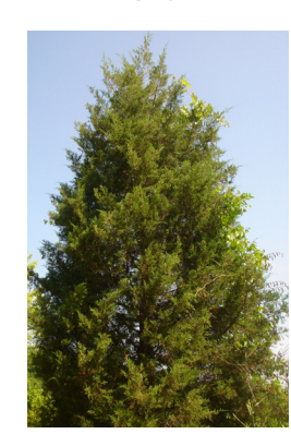
Eastern Red Cedar (Juniperus virginiana) – 16-66 feet tall, evergreen, conical shape; blue, waxy berry-like cones; reddishbrown bark peels off in strips